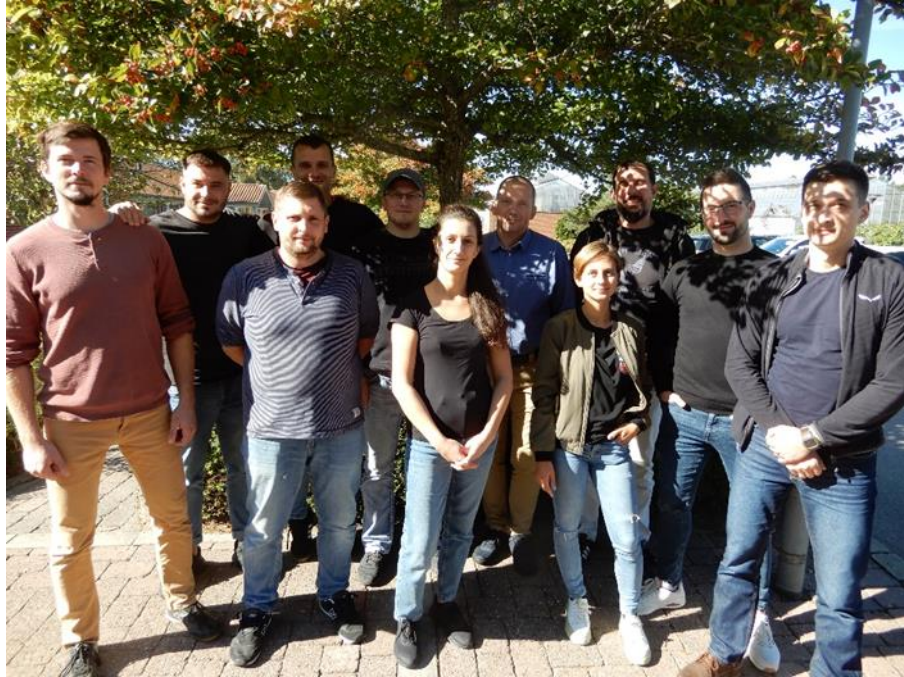
The DFA MSP Team 2022-23

The DFA CMP course for Crop managers is scheduled to start in week 8, 2023 (February 21 – 24) with the first seminar in Denmark. The second of three will be held in Romania (7-9 June) and the final seminar in Slovakia in November 2023.