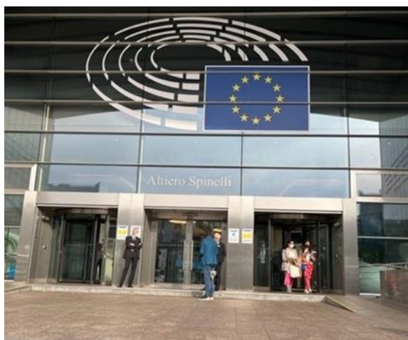
Main entrance to the EU Parliament

The group had to go through a thorough accreditation before it was allowed to enter the Parliament and one had to wear Covid 19 bandages during the tour. But still it was a great experience.