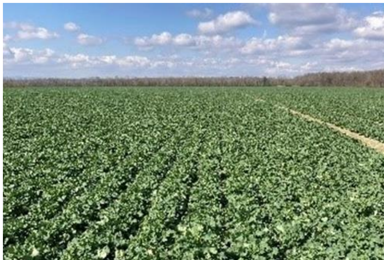
Winter rapeseed at Goodvalley, Ukraine is in good shape

Overall, it has been a good growing season so far. Early start to spring with low temperatures, which has given the crops a quiet start. Both organic and mineral fertilizers have been brought out on time. Tillage has run painlessly, it has generally been dry, without being too dry.